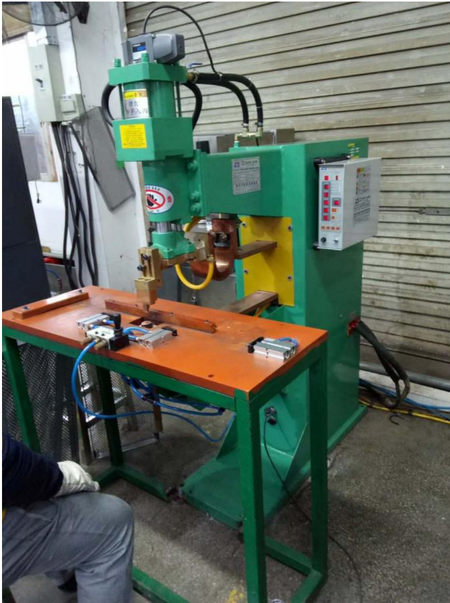
A corner of the spot welder warehouse