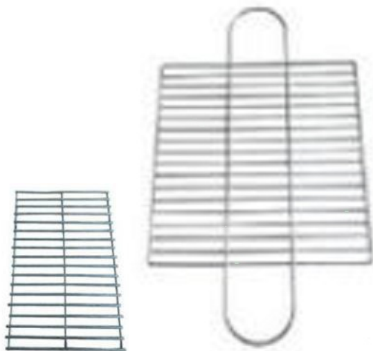
Stainless steel welding