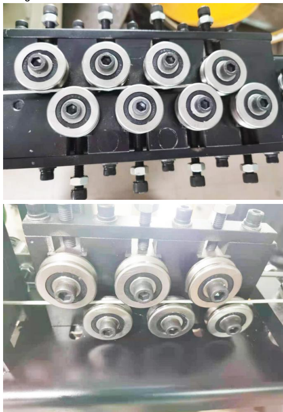
Assembly workshop of all-in-one circular butt welding machine